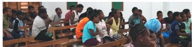
Around 50 on average attending our Youth Services!